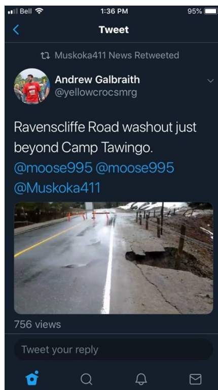
Muskoka Road 2 at Easter