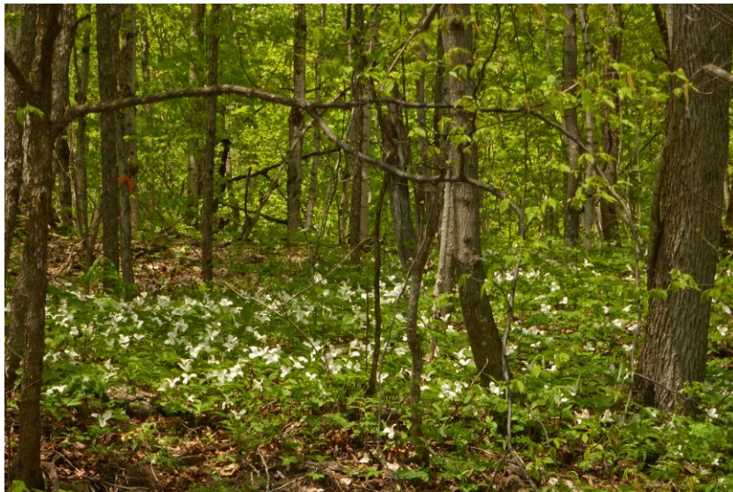
Fox Lake in Bloom, photos by Ellen Fox

NEW!! You can now do an email money transfer for quick and easy payment! Email your dues to j.mcmahon@sympatico.ca ; please make sure to include which property you are paying for in the email body.